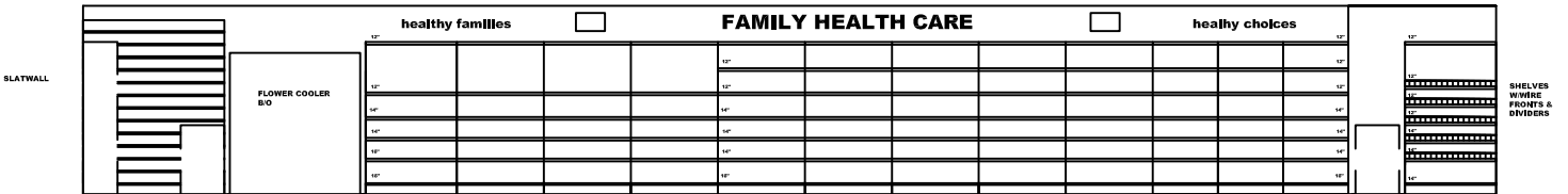
4 LEFT WALL ELEVATION A-3 1/4" = 1'-0"